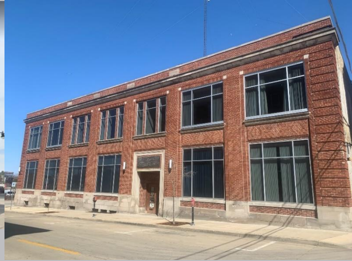
Public Parking Nearby