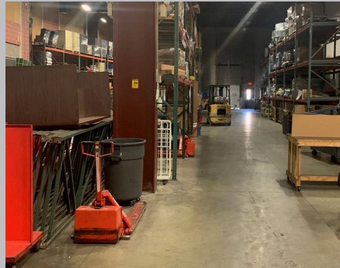
Warehouse Space Available